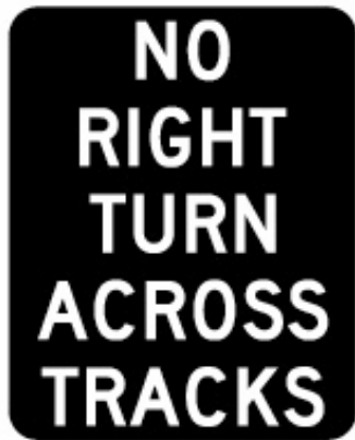
R3-1a Activated Blank-Out