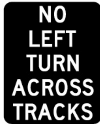
R3-2a Activated Blank-Out