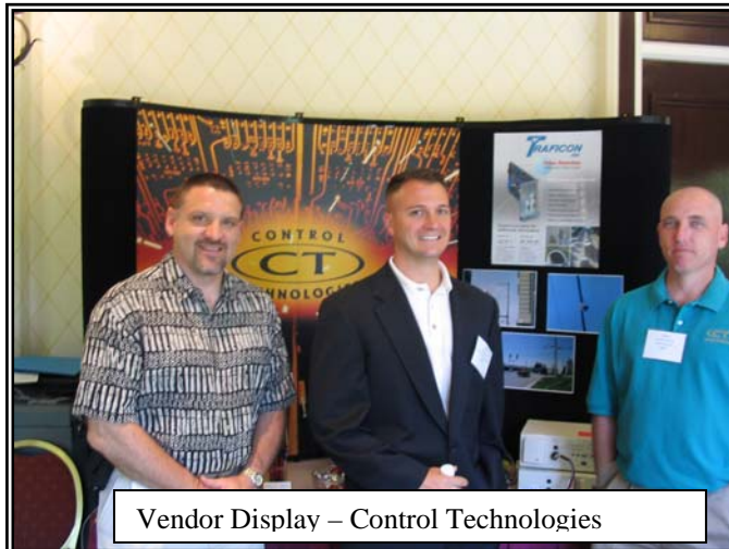
Vendor Display – Control Technologies