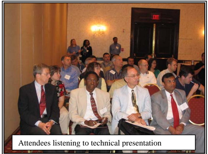
Attendees listening to technical presentation