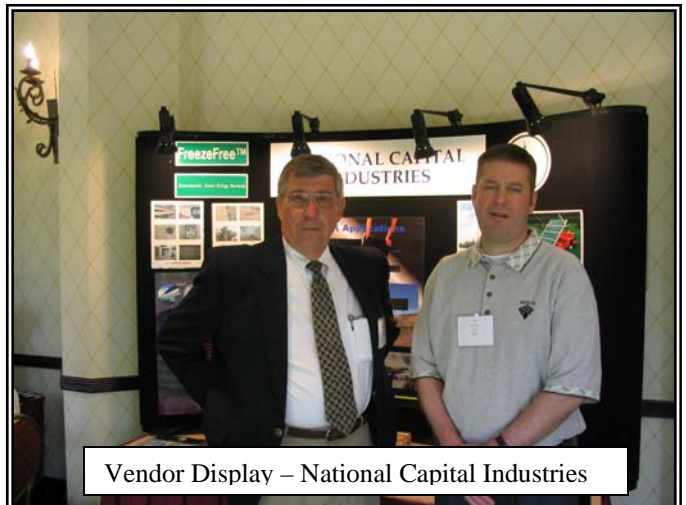
Vendor Display – National Capital Industries