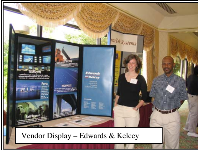
Vendor Display – Edwards & Kelcey