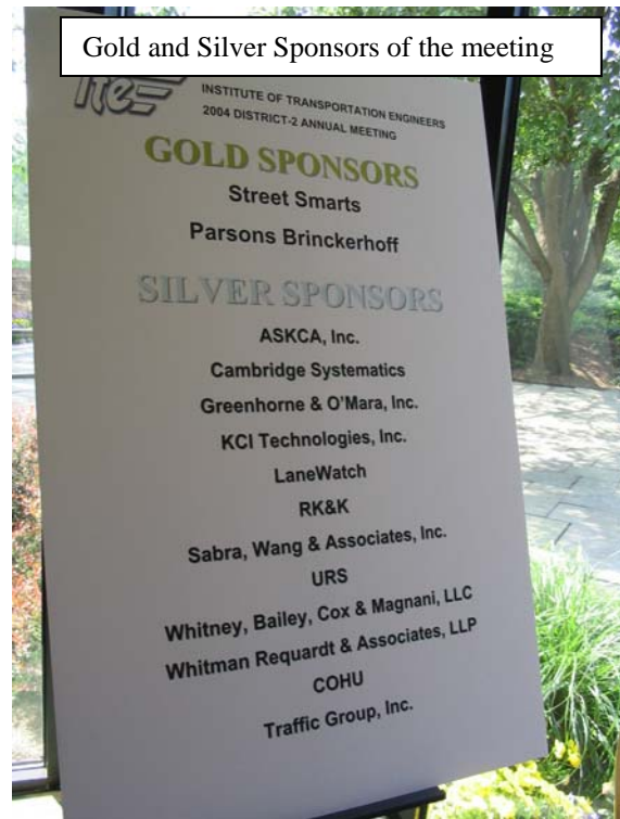
Gold and Silver Sponsors of the meeting