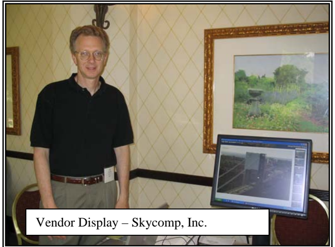
Vendor Display – Skycomp, Inc.